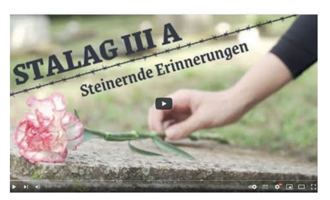
Film (German) on YouTube: www.youtube.com/watch?v=ppT7N6x2QgY