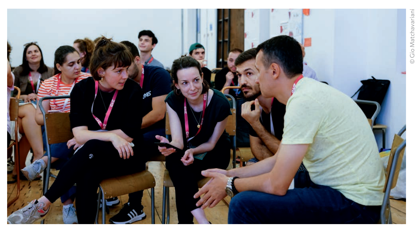
MEET UP! Youth Conference "Power of Youth" in Tbilissi, Georgien (2022)

Thank you so much for giving me the opportunity to take part in the "Power of Youth" Conference. I am thrilled with the valuable workshops, the great participants and the excellent organization. I felt that I was in good hands. It was great to meet all these talented people, listen and express my opinion, both during the "official part" and also in small conversations. (...) It was a great opportunity to open minds and to meet like-minded people. I feel the power!